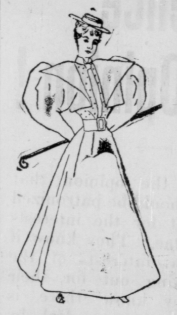
THE SMART NEWPORT GIRL.

Marie Fourcand describes the dress of a young lady at Newport thus rapturously: "She had a sailor hat of white enameled leather perched on one side, and a fascinating head, and wore a gown of white canvas with a pink silk shawl spotted in white."