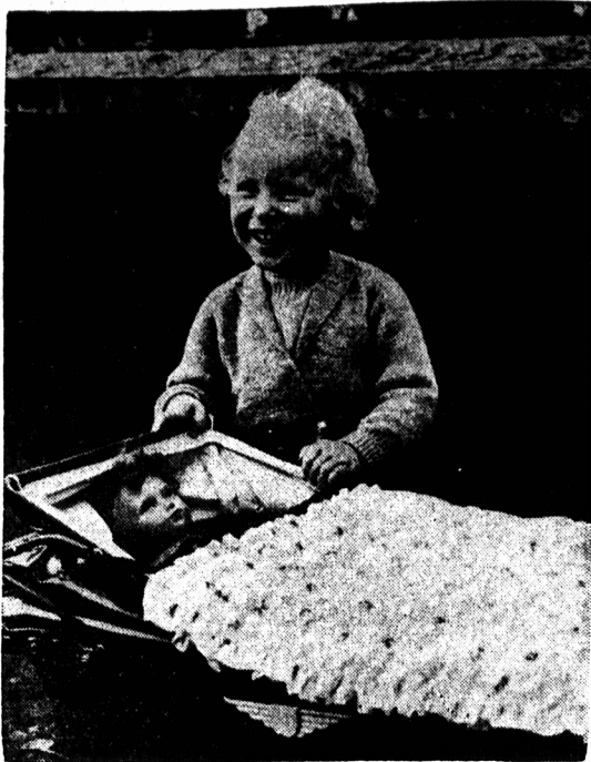
Princess Anne Plays Mother