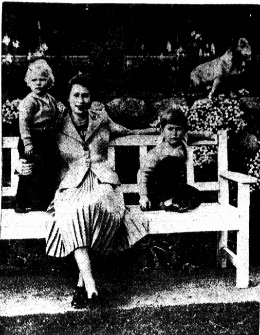
Queen Relaxes After Romp with Children, and Pet "Susie"