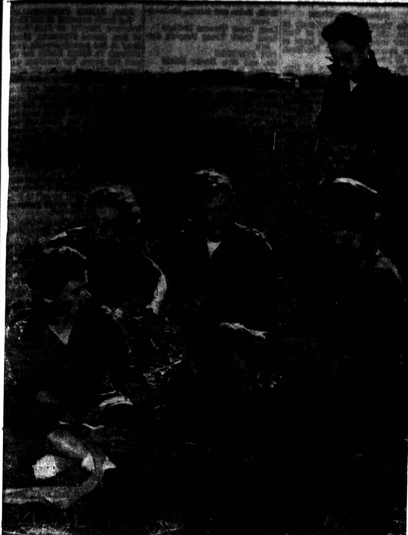
FIRST AID IN THE FIELD

TWO HEADS BETTER In the old days men believed investing was too difficult for women but today two heads are