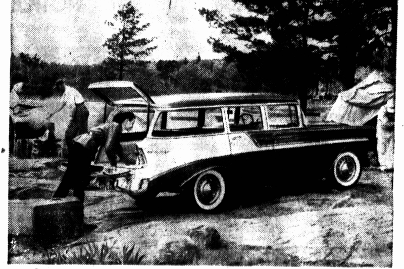
Load'er up, point'er at pleasure, and let'er go! Chevrolet takes the miles like she owned them!

Yes sir, you pick a terrific traveller when you choose Chevrolet! That's something you sense the minute you ease it out into traffic... just a nudge of your toe, and you can feel this great road car say "Let's go!" Try it on the straightway, up a high hill, around a tight curve - you'll thrill to the responsiveness, the rock-steadiness of the Chevrolet ride, the sweet and sure control. There's a Chevrolet waiting for you now. Come try it. A GENERAL MOTORS VALUE