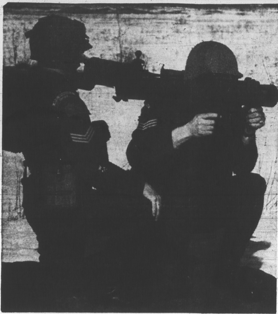
TRAIN WITH ANTI-TANK WEAPON

Two members of an infantry regiment undergo training with the "Carl Gustav" anti-tank weapon with which Canadian troops serving with the NATO Brigade in Europe were equipped several