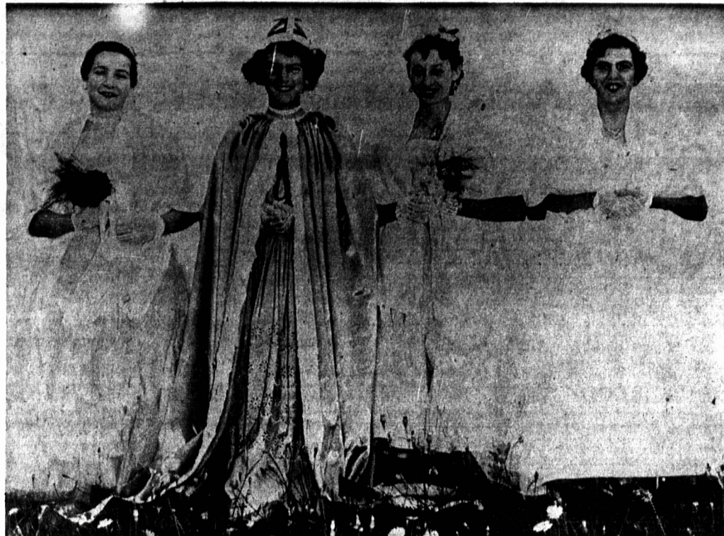
ACADIAN QUEEN AND PRINCESSES