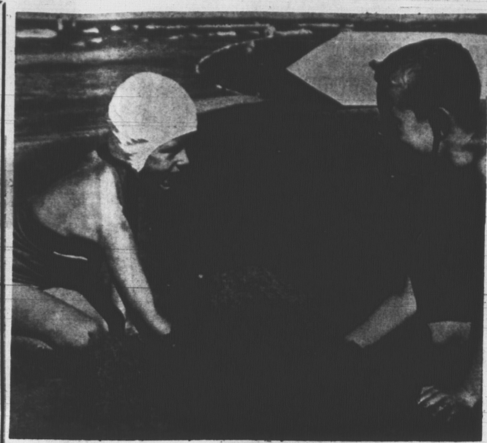
Children at play on one of the many P.E.I. beaches.

Handcraft Summer School NORTH RUSTICO JULY 19 TO AUGUST 27 Conducted by the Handcraft Branch, Department of Tourist Development. Adult visitors to the Province or Island residents may enroll for instruction in: • Weaving • Woodturning • Textile Painting • Copper Enamelling • Silvercraft • Lampshade Making • Basketry • Slipper Making (Shearing) For children, age 6 to 13, there are various craft projects. One-day projects are featured, but you may enroll for as many days as you wish for further instruction.