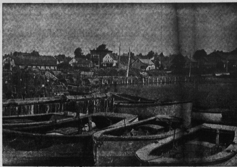
GEORGETOWN AS THE LOBSTER SEASON NEARS

KITCHENER, Ont. (CP)—John Wintermeyer might be replaced as Ontario Liberal leader if his party loses the next provincial election, the Ontario Young Progressive Conservative conference was told Friday. Heath Macquarrie, Progressive Conservative member of Parliament for the Prince Edward Island Riding of Queens, said there seems to be reason for a rumor that Mr. Wintermeyer will be replaced. He said he saw no reason why the Liberals wouldn't lose the next election, and it is "little wonder" that a public opinion poll "gives Premier Roberts almost a 4:1 lead over his chief opponent." Mr. Macquarrie said the federal Liberal party seeks to justify its half-hearted and uncertain steps in the field of national security "by claiming the Conservative party had not done such and so." "Let them state clearly what the defence of the country requires," he said.