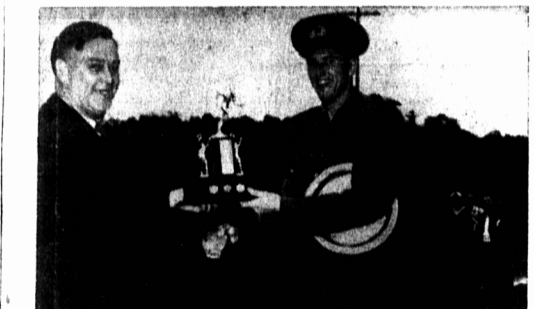
WINS MEMORIAL TROPHY