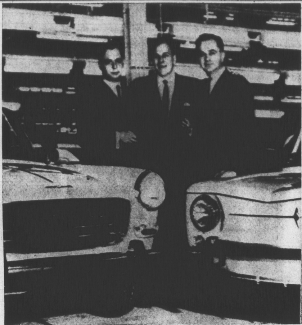
FIRST RENAULTS, PEUGEOTS MADE IN QUEBEC

Auto company officials stand beside the first Peugeot, left, and Renault cars completed Friday at their assembly plant at St. Bruno, near Montreal.