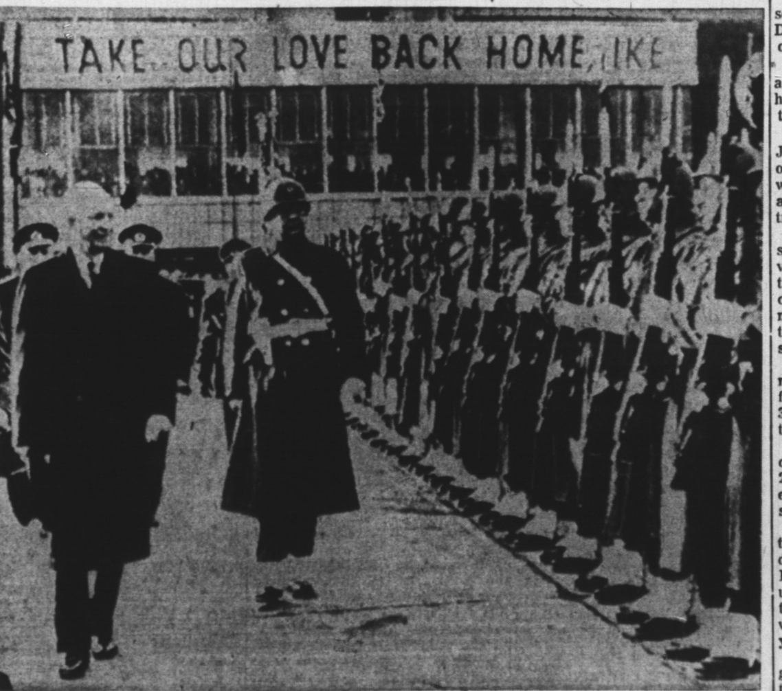
There is an unusual twist in this inspection of an honor guard as President Eisenhower reviews one in Ankara, Turkey. The troops do not speak the same language as I like but the sign strung nearby is in English and it bears a heart-warming message.

Mr. Pickersgill said that in presenting Liberal policy the party should remember that it never has had to change its name or apologize for its record.