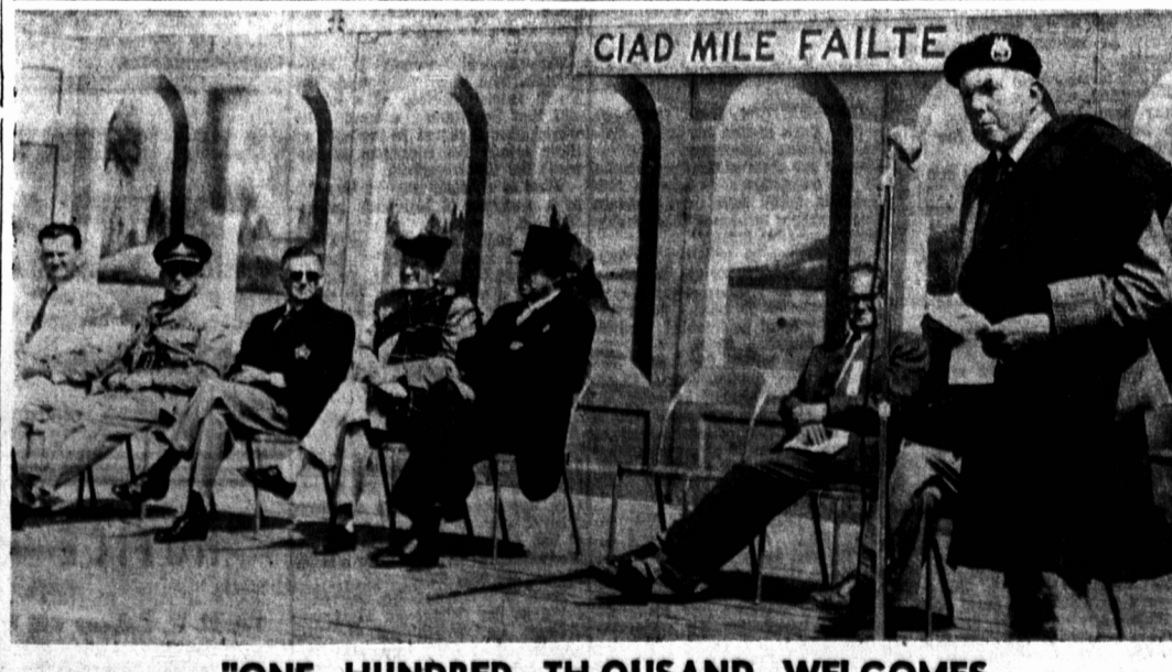
"ONE HUNDRED THOUSAND WELCOMES"

Wednesday's demonstration outside the commission's billets was short-lived. Demonstrators, wet to the skin and weeping, left in disorder. There were no casualties, but a South Korean army source claimed that 17 Koreans were seriously injured and 19 slightly hurt Tuesday night when American military police used tear gas bombs to disperse about 20,000 demonstrators in Pusan.