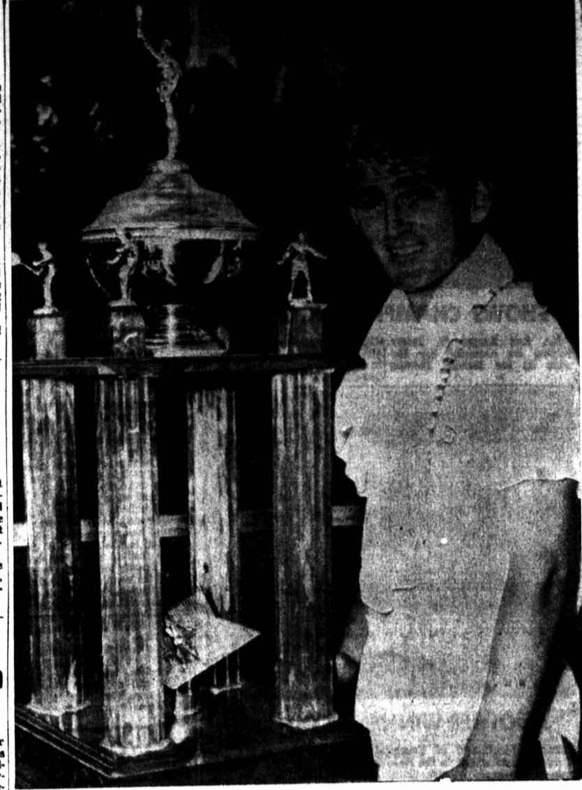
LEW HOAD WINS TROPHY