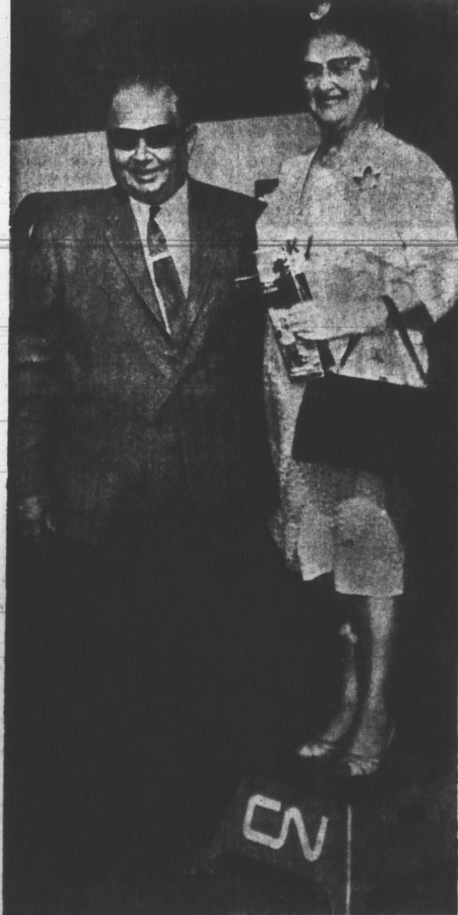
OFF ON VACATION