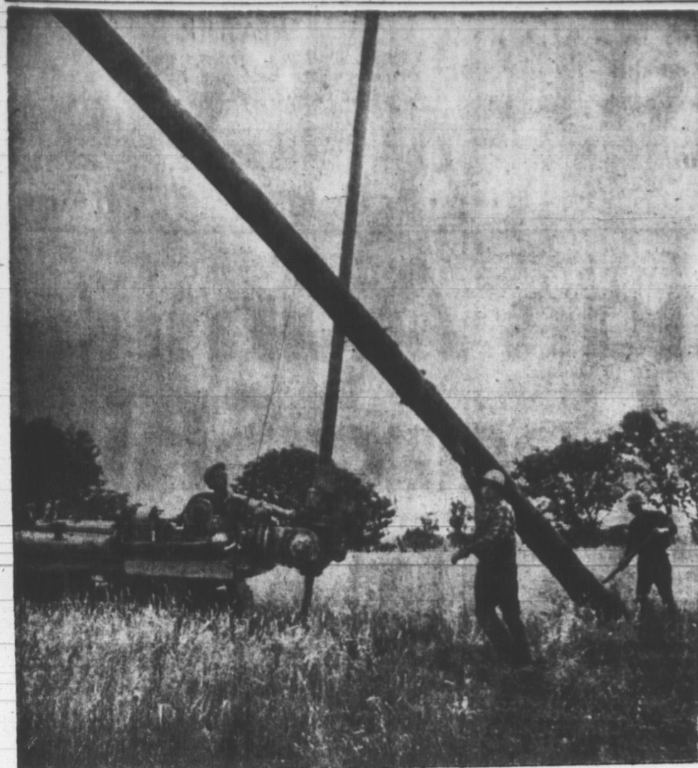
CREWS ERECT POLES AT FRENCHFORT ON NEW EASTWARD LINE COSTS $350,000

Workmen are taking advantage of ideal weather conditions to keep construction of the heavy water plant at Glace Bay, N.S., slightly ahead of schedule. The $30,000,000 plant is scheduled to go into production in mid-1966.