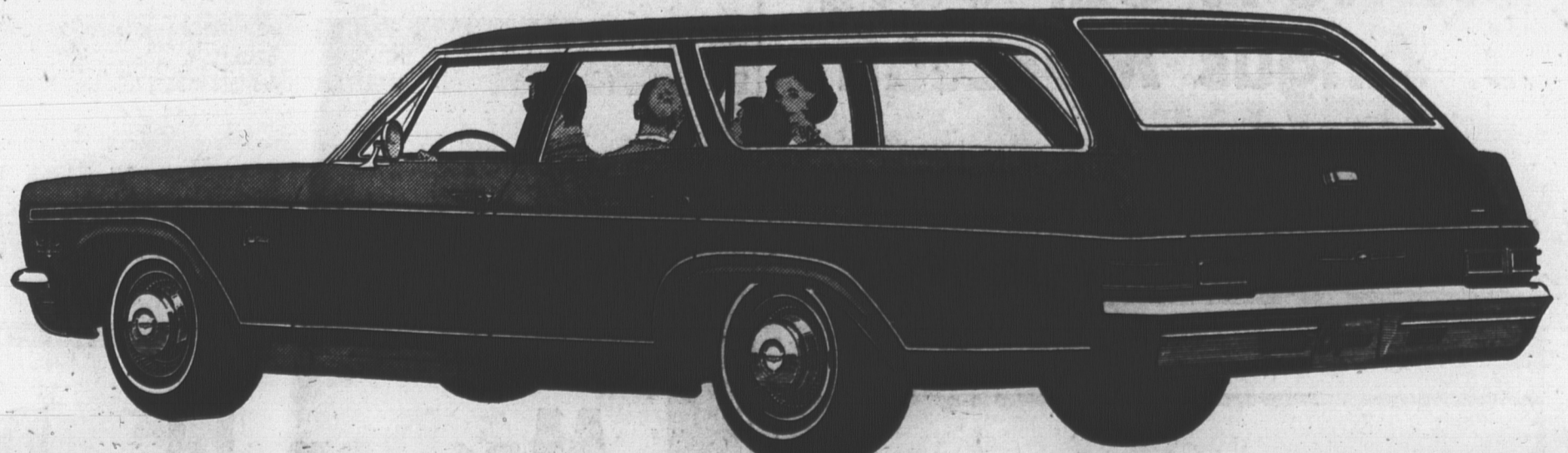
Caprice Custom Wagon—with fine new look of hard-wood paneling on sides and tailgate.

A new choice of superbly crafted Chevrolets above and beyond anything else in the line. If this is your year to move up, you just can't move up to much more car than this.