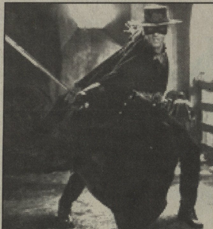
Antonio Banderas is "sssmokin" in the 1998 film, The Mask of Zorro .

that smoking was ruining him," insisted his wife. "It finally came down to me giving him a choice: either the cigarettes went, or I went."