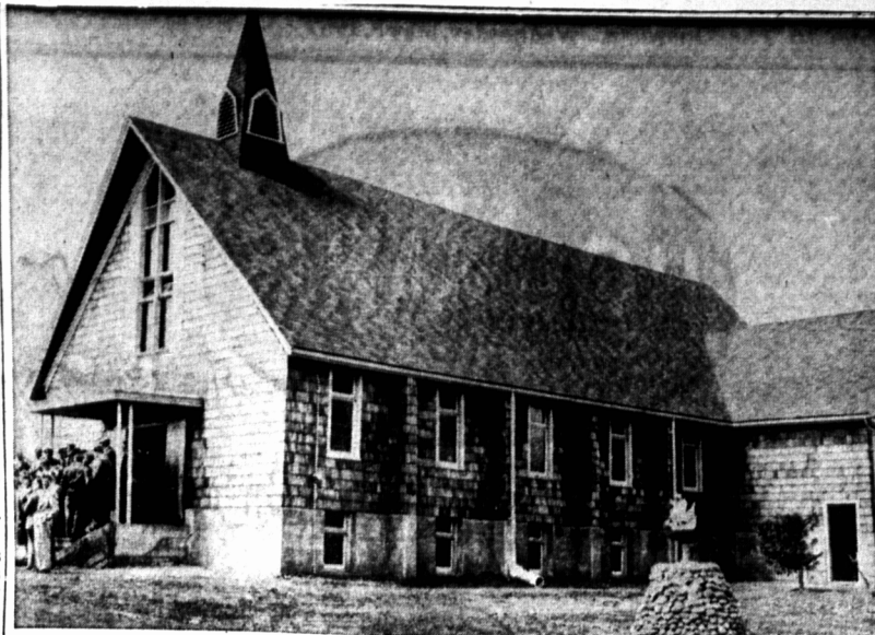
THE NEW UNITED BAPTIST CHURCH AT O'LEARY