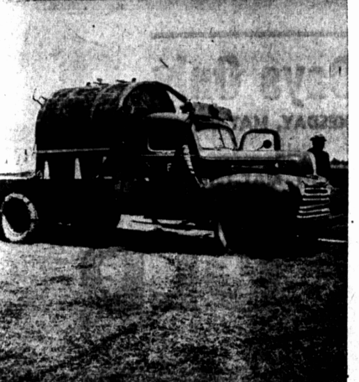
THE PUMPER truck of the Kinkora Fire Department, purchased less than a year ago after the village became incorporated, is seen in action at the fire in Kinkora yesterday, and is credited with saving a building in the village which ignited from burning embers sprayed over the village by a strong breeze which carried the sparks about three-quarters of a mile.