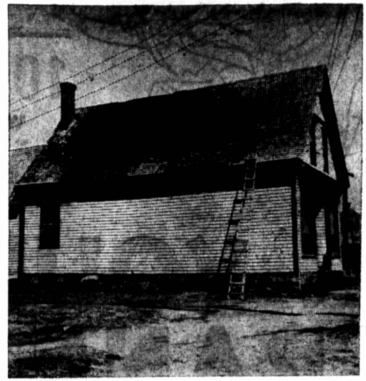
A CONSIDERABLE portion of the roof of the store building above was burned at Kinkora yesterday when sparks from a burning barn about three-quarters of a mile distant, fell on and ignited the building owned by J.P. Callaghan, in which J.F. Morris operated a retail store until recently. This fire was extinguished by the Kinkora Fire Department using their pumper truck.