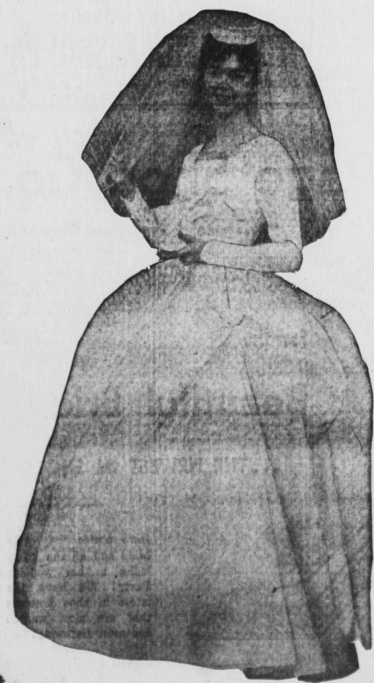
BRIDAL GOWN FROM EATON'S (Modelled by Roberta Lappia)