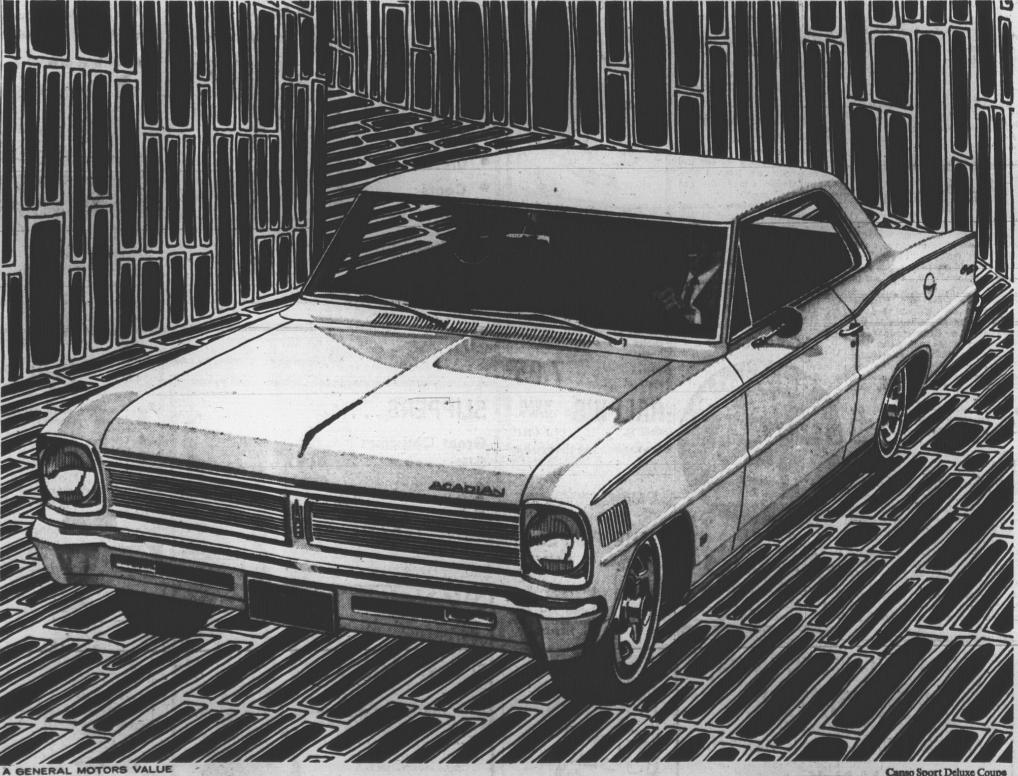
A GENERAL MOTORS VALUE

seats and color-keyed, long-lasting wall-to-wall carpeting. Gas-saving standard power team for the '66 Acadian matches a peppery 120-horsepower thrift six to a new transmission fully synchronized on all three forward speeds. The engine has seven main bearings for long wear, and thrives on a restricted diet of regular-grade gasoline. For high-speed highway driving, trailer-toting, or just plain high spirits, two V8's are available. The standard V8 develops 195 horsepower; then there's a no-kidding-around 327 cubic inch, 350 horsepower V8. Also available: four-speed fully-synchronized or automatic transmission. Get in on the fun today. See and drive an Acadian.