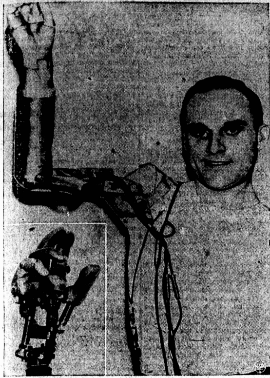
GOOD RIGHT ARM — A new electrically operated arm, driven by a tiny motor controlled by the amputee's toes in a specially designed shoe, is being put into mass production.