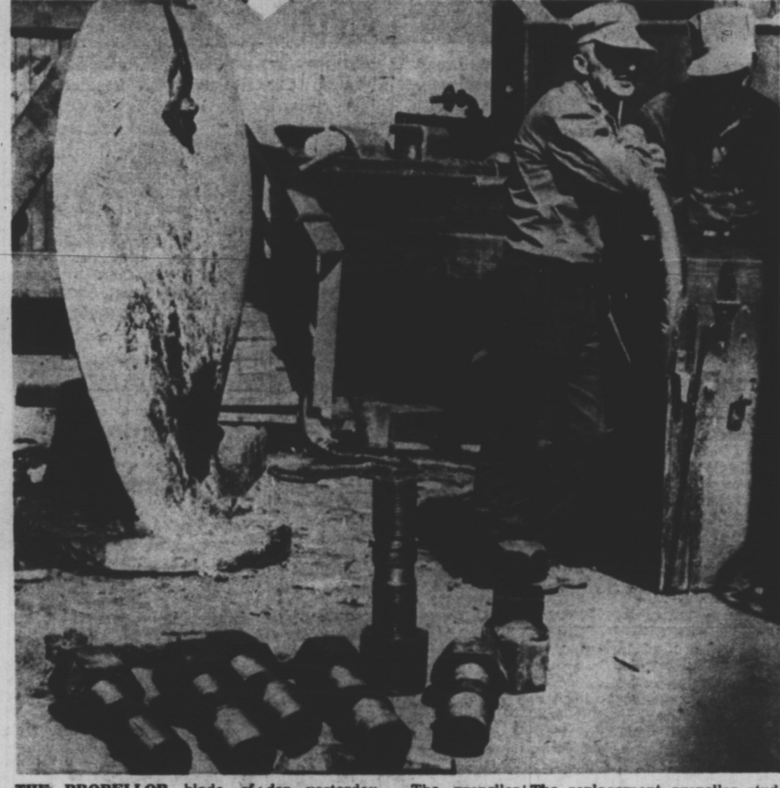
THE PROPELLOR blade of the ferry stands at bottom of picture are about five and one-half feet long and weigh up to 40 pounds each.