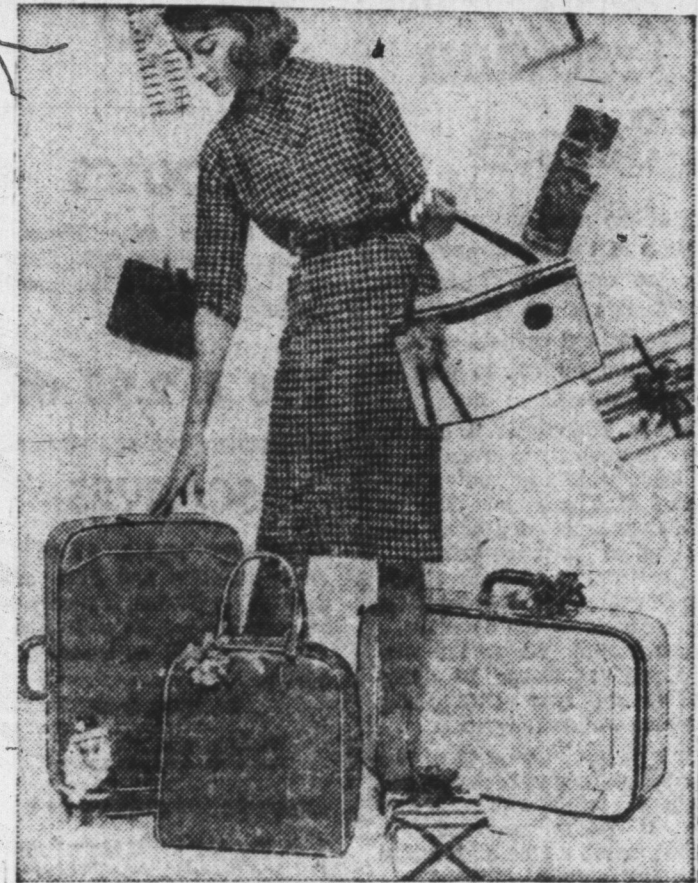
CHRISTMAS IS "Starter" time... time to start a set of luggage for someone special. For example a man's set might include (left) a tailored companion bag with matching

Any of these in combination, or singly to match luggage already