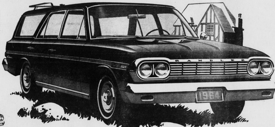
770-4 Door Station Wagon