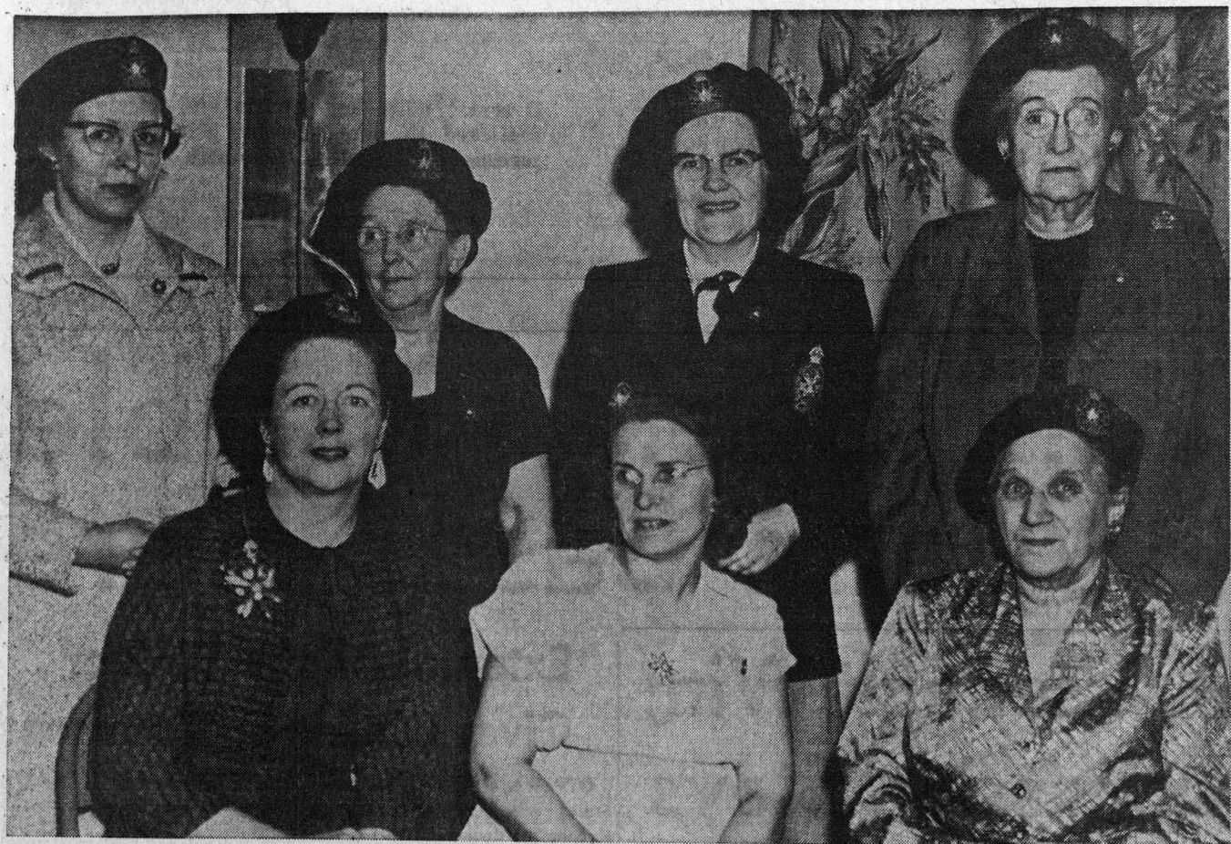
LADIES AUXILIARY OF CANADIAN LEGION