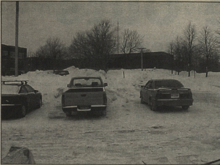
The stink-ass car on the left is not only on the roadway, but also taking up two spots. Good on ya, buddy! Even the truck takes up too much room, goddammit!