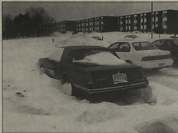
This horribly parked crap-mobile had been taking up two spots for weeks, and is slowly being covered with snow. I blame it on high tuition.