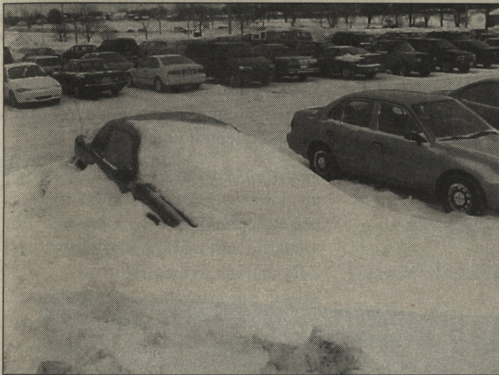
In this image, you can see this beast of a car slowly vanishing beneath the snow. One would almost reckon that this car has been abandoned.