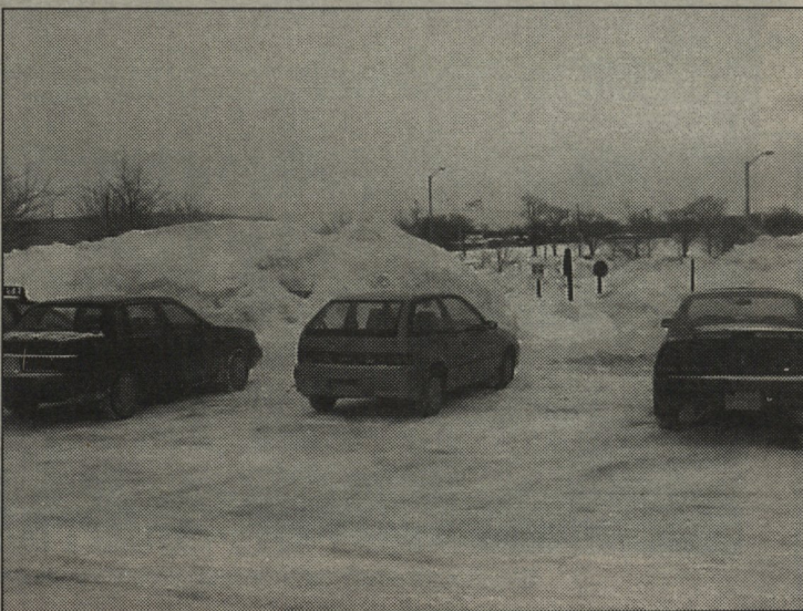
This small turd-of-a-car is brazenly taking up two spots. Tonight, I sleep with your license plate, pal-o!