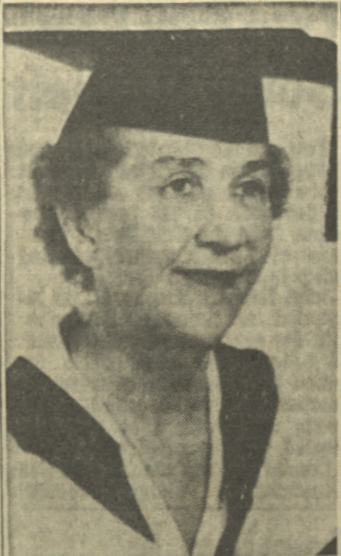
B. ED. DEGREE

Show then, a silent now, sharp against the window. "Shall we make a new rule of life from tonight: always try