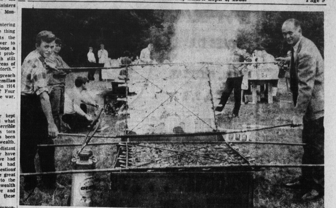
COUNTRY LAWN BARBECUE HELD

LONDON (Reuters) — Prime Minister Macmillan said here today that the prospects for the Commonwealth would benefit if Britain were "more and more at centre" of world affairs as a member of the European Common Market. Macmillan was answering questions in a radio interview about the prospects for the Commonwealth prime ministers conference opening here Monday. He said "Britain, by entering Europe . . . will give the thing that most of all affects the Commonwealth: The power to take some part—and I hope a leading part—in the great problems of the world which still centre in the sensitive areas of Europe, Russia and so forth." "Some people still preach isolationism here," Macmillan said. "We were isolated in 1914 and what was the result? Four years of the most terrible war in my youth."