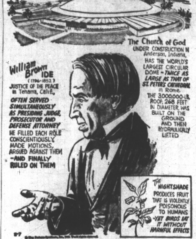
The Church of God UNDER CONSTRUCTION IN Anderson, Indiana, HAS THE WORLD'S LARGEST CIRCULAR DOME—TWICE AS LARGE AS THAT OF ST. PETER'S CATHEDRAL IN Rome.