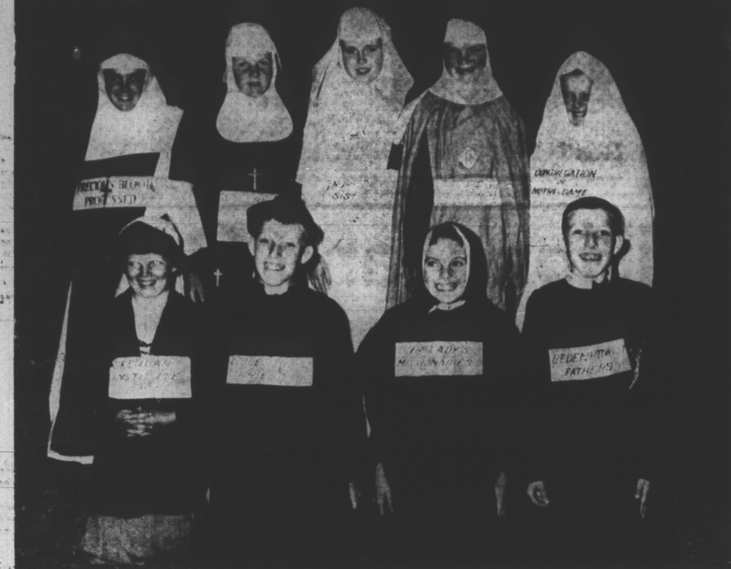
THE CATECHETICAL School held at the Sacred Heart Church in Alberton concluded with a vocation rally and missionary pageant.