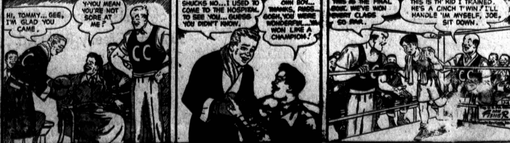
By Ham Fisher