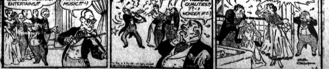
By Al Capp