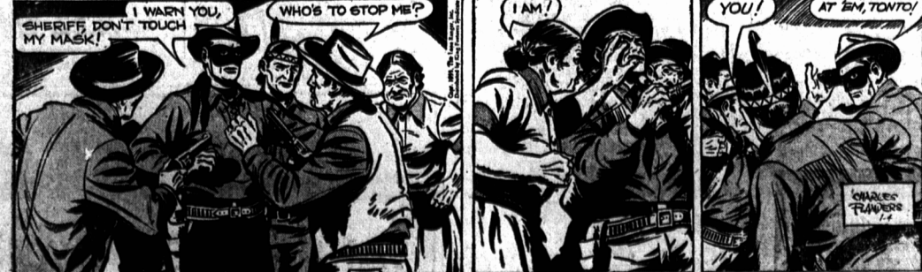
By Fran Stryker