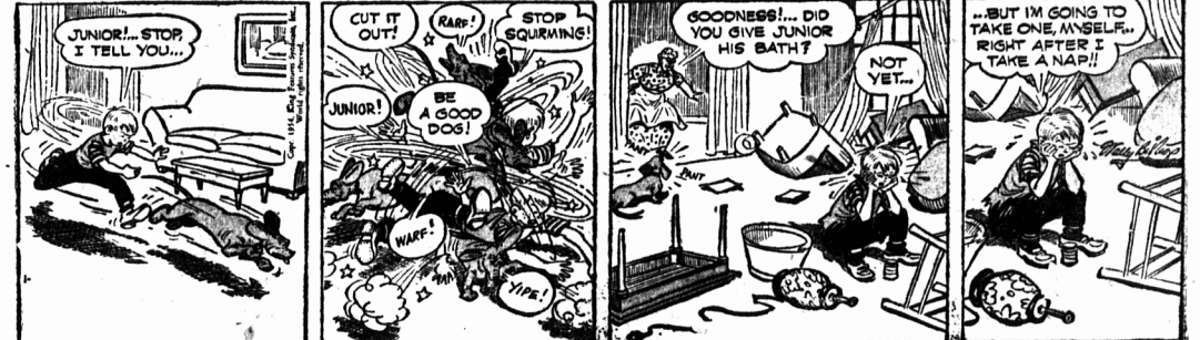
By Wally Bishop