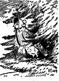
"If it just rains it won't matter," thought Mrs. Grouse.

It was along toward morning that Mrs. Grouse awakened from a long nap. The rain was no longer falling. The air was colder. She became more uneasy than ever. She had a feeling that Jack Frost was busy there in the Green Forest. Her winter coat of feathers would keep her warm. She wasn't worried about what Jack Frost might do to her.