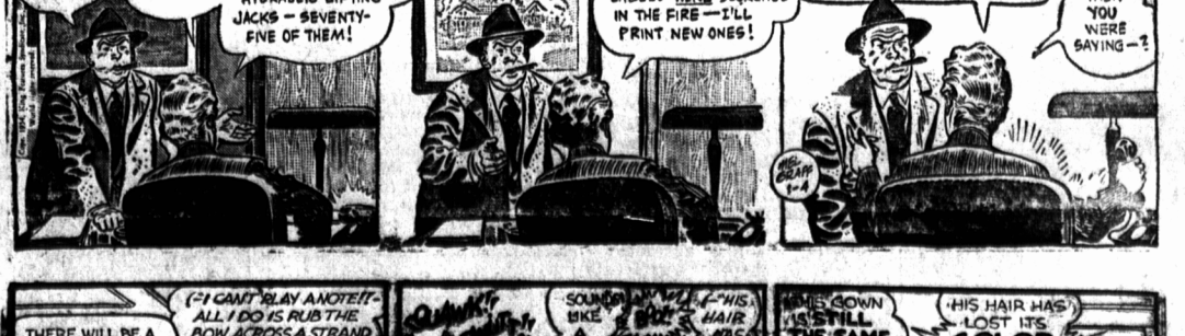
By Mel Graff