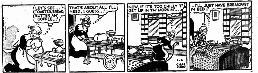
By Charles Kuhn