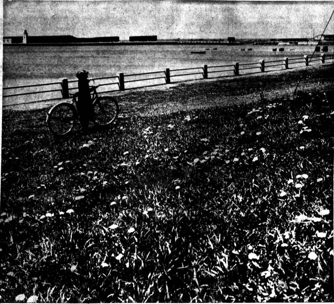
THE LURE OF THE SEASIDE

The fascination of the Sea is alluring to everyone, and children, their elders, take rest-