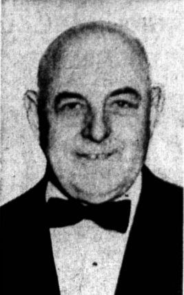
LT. GOVERNOR PROWSE