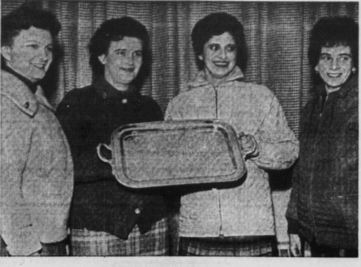
TROPHY WINNERS Lady curlers recently completed the competition for the second year Fisher Bros. trophy at the Charlottetown Curling Club and it was a four-

MILLS MEAT MARKET 135 Hillsboro St. Dial 4-4285