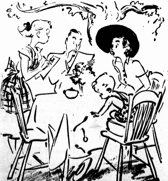
"Can you give him a few menus to tear up—so we'll have time to order!"