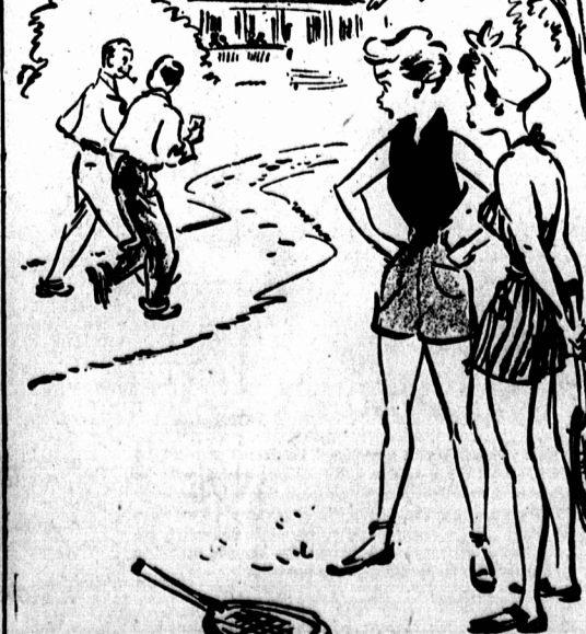
"Pretty informal place! Guys going around with their coats off!"