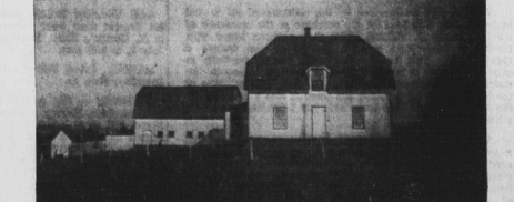
RELAX IN PRIVACY Have a look at this 100 acre show farm, partly wooded to insure complete privacy, with land sloped to sandy beach. The house has 7 rooms with light, water, new small barn, both in excellent repair. A short distance from Brackley Beach Hotel, on paved highway. SEE IT TODAY! Auctioneer J. Arthur Stewart Kensington 46-23