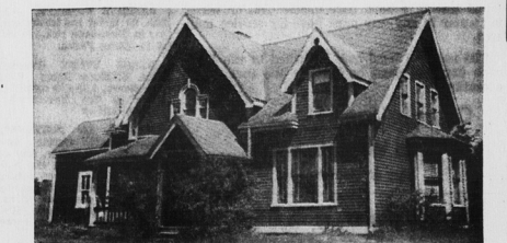
DUPLEX—IMMEDIATE POSSESSION CAN BE YOURS Spacious 2 and 3 bedroom duplex. Spacious, landscaped yard, close in location, new hot water oil furnace, double garage, low taxes. The price may surprise you. Call us.

STANLEY MOL REAL ESTATE LTD. "BIG PROPERTY CLEARANCE" 78 Gt. George St., Charlottetown PHONE 2-1611 For Inspection Appointment