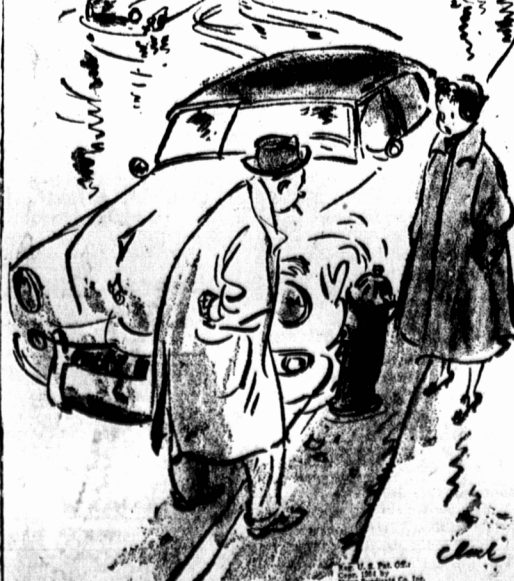
"Well, we went for a drive to get our minds off our problems."