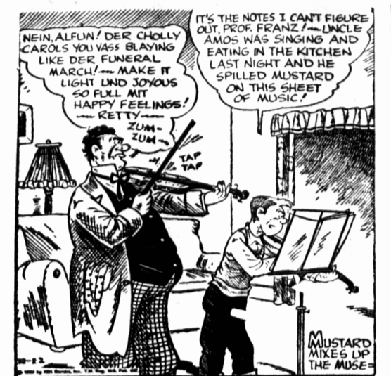
OUR BOARDING HOUSE MAJOR HOOPLE OUT OUR WAY