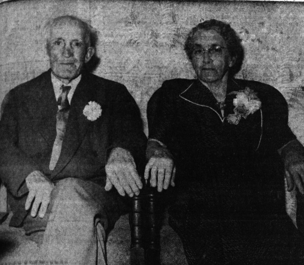
GOLDEN WEDDING CELEBRANTS