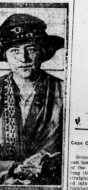
Miss Anne Morgan

If reports are true, America's best known and wealthiest bachelor girl, Miss Anne Morgan, may soon marry. Miss Morgan has been active recently as chairman of the executive committee of the American Committee for Devastated France.