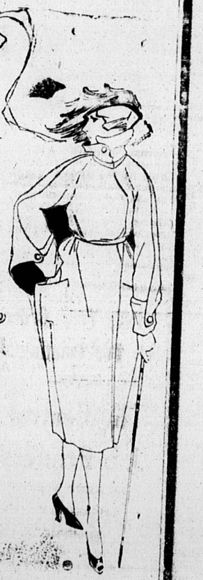
Cape Coat for Motoring or travelling.

The shops are filled with splendid values in winter coats just now and spring wraps will soon be crowding these out of the limelight. Models featuring overcapes either attached or detachable, are much to the fore, and the conventional cape is also to be with us again, exceedingly attractive both as to fabric and style variety.