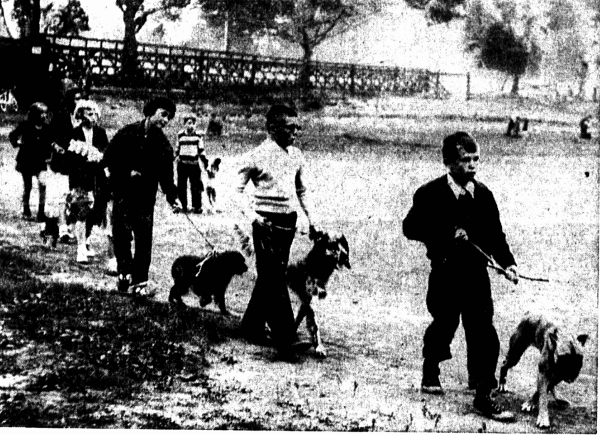
It seems as though the old saying, "Man's best friend is his dog," still holds true, judging from the large number of species of the canine family which were entered in the "Pet Parade". Several of the entries can be seen in the above picture.