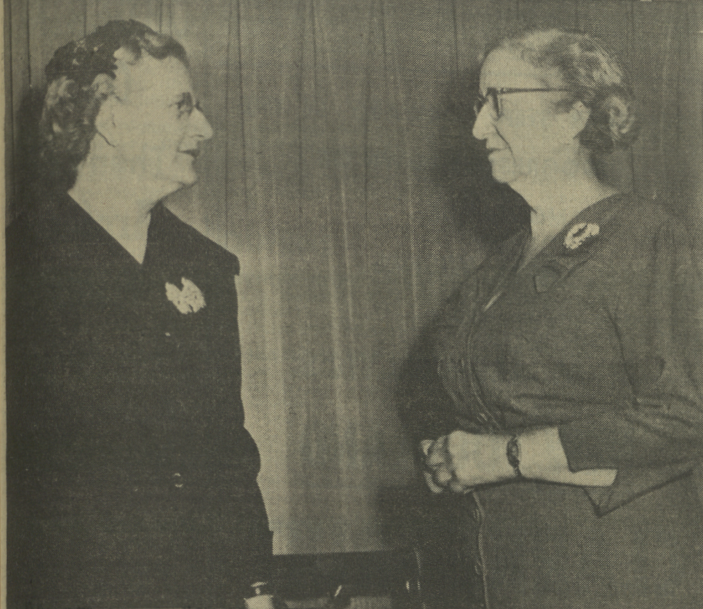
SPEAKS TO C.F.U.W.