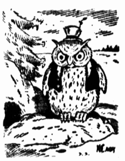
Hooty the Owl had lighted on Johnny Chucks' doorstep.

The biggest thing may be in the end, upon the smallest thing depend. — Old Mother Nature. Peter Rabbit's heart was going pitter pat, pitter pat, pitter pat, it was going pitter pat so fast that it seemed to come right up in his throat. He had just had the narrowest of narrow escapes. Anyway he had escaped for the time being.