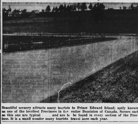
Beautiful scenery attracts many tourists to Prince Edward Island; aptly known as one of the loveliest Provinces in the entire Dominion of Canada. Scenes such as this one are typical and are to be found in every section of the Province. It is a small wonder many tourists travel here each year.