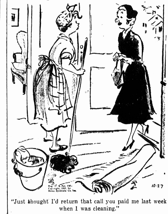
"Just thought I'd return that call you paid me last week when I was cleaning."