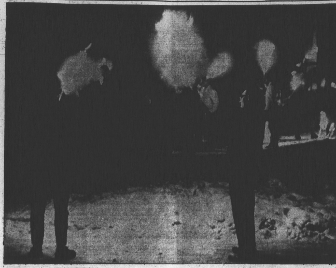
STUDENTS FROM St. Dunstan's University rallied at Confederation Square last night for their Torch-Light Parade which got the university's annual Winter Carnival off to a start. The students,

All people interested in the Liberal Party are invited, with a special invitation to all ladies and young people.