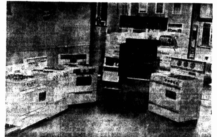
ISLAND PROPANE GAS RETAIL STORE CH'TOWN