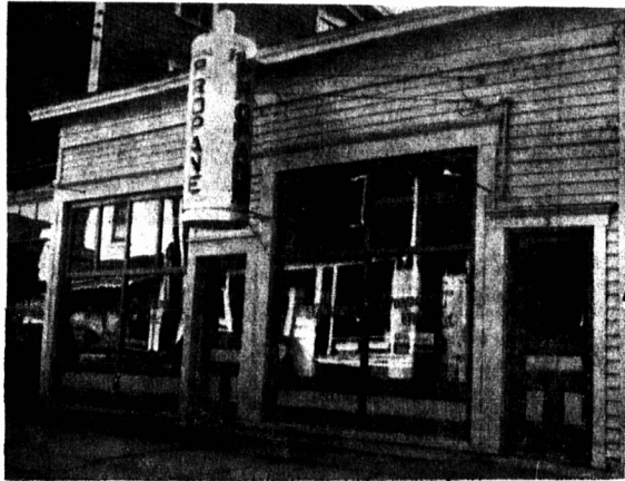
ISLAND PROPANE GAS RETAIL STORE S'SIDE

Opens New Cylinder Filling Plant At New Annan