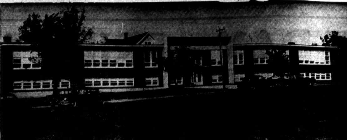
THE NEW SUMMERSIDE High School (above) as well as the new auditorium, will be officially opened this afternoon in a program of general public will have the opportunity to inspect the building.