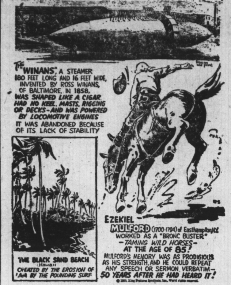
THE WINNANS' BELIEVE IT OR NOT

THE WINNANS' A STEAMSHIP 160 FEET LONG AND 16 FEET WIDE, INVENTED BY ROSS WINNANS OF BALTIMORE IN 1858, WAS SHAPED LIKE A CIGAR HAD NO KEEL, MASTS, RIGGING OR DECKS—AND WAS POWERED BY LOCOMOTIVE ENGINES. IT WAS ABANDONED BECAUSE OF ITS LACK OF STABILITY.