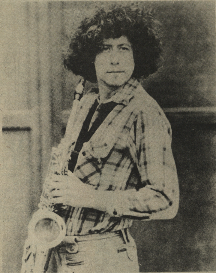
ARLO GUTHRIE and his band will be appearing with American folk legend PETE SEEGER as special guest headliners at this year's Atlantic Folk Festival. The Festival will be held August 1, 2, and 3, at the Moxsom Farm, Hardwood Lands in Nova Scotia.

The event will begin on Friday at noon on August 1, and entertainment, as in past years will begin around noon on Saturday. Tickets for the Festival will go on sale in outlets all over the Atlantic Provinces on June 1st.