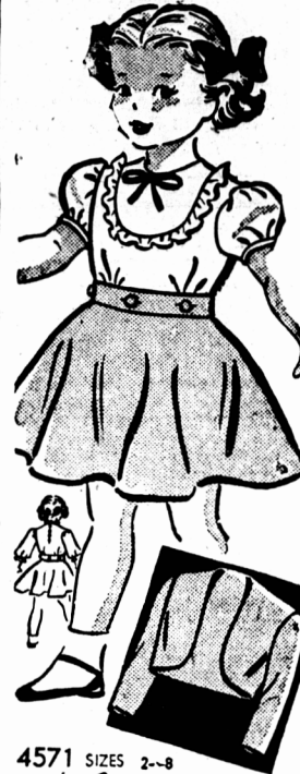
4571 SIZES 2-8

Dress the cutest little girl in the world in the darlingest ensemble! Button-on whirlly skirt is just like Mother's new circular skirt! Blouse, ruffy and be-bowled, can have longer sleeves if you like. And that bolero makes a smart addition for winter! All easy-sew! Pattern 4571; sizes 2, 4, 6, 8. Size 6 skirt and bolero 1 ½ yards 34-inch; blouse, 1 yard 35-inch. This pattern easy to use, simple to sew, is tested for fit. Has complete illustrated instructions. Send Thirty-five Cents (35c) in coins (stamps cannot be accepted) for this pattern. Print plainly Size, Name, Address, Style Number. Care of The Guardian, 60 Front St. West, Toronto, Ontario.