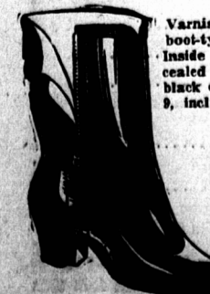
Varnished, lightweight boot-type rubber gaiter. Inside opening with concealed slide fastener. In black or brown. Sizes 4 to 9, including half sizes.