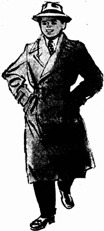
Boys' Navy Blue Gabardine Trench Coat. Satin lined, all around belt. Sizes 32 to 36, as illustrated.