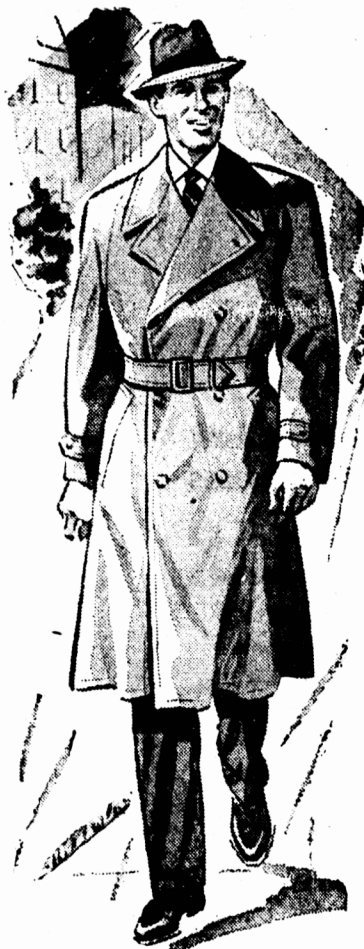
Naval Officers Burberry. Satin lining with rubberized inter-lining. Raglan sleeve. All around belt. Navy blue, in Men's sizes. A Croydon garment.