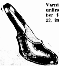
Varnished, light weight unlined toe-over. All rubber foot hold. Sizes 4 to 12, including half sizes.